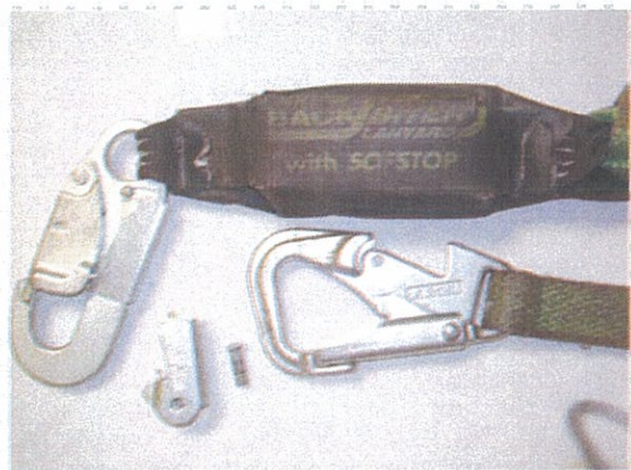
Miller Back Biter lanyard being used by employee at time of failure. Date of manufacturer of this particular lanyard is 05/09/08. In service date of this lanyard was 02/17/09.

Event Summary: Employee working for contractor group onsite. Employee was utilizing a Miller Back Biter double lanyard attached to his harness and inspected this fall protection prior to use. While maintaining 100 percent tie-off (continually transferring one of his two lanyards to anchor points), employee noticed something fall out of the corner of his eye. Employee looked down and saw the locking keeper of one of the snap hooks had fallen to the ground. At the time of the failure, employee had the lanyard looped around an anchor point and tied back into itself (appropriate usage). Employee immediately descended to grade level and found the locking keeper and the rivet that held the keeper in place. Employee immediately descended to grade level and found the locking keeper and the rivet that held the keeper in place.