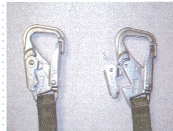
Side by side comparison of the two snap hooks on the lanyard that failed. Neither snap hook appears to show any signs of damage or abuse. A better look at the clean shear of the rivet holding the locking keeper to the snap hook.

Action Needed: There was an identical incident in October of 2008 at another facility (same manufacturer, same model and same failure). If you are currently using Miller Back Biter lanyards (either single or double legged), an immediate inspection by a competent person is needed. If there is any question to the integrity of a lanyard, remove it from service and contact your supervisor or a contractor safety professional on a path forward. Additionally, your company should evaluate whether to continue to utilize this lanyard.